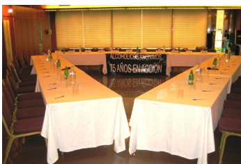
President, custodians & delegates tables

all people for all time who have an alcoholic problem may enter these halls unasked and feel welcome. We need it to ensure that Alcoholics Anonymous never asks of anyone who needs us what his or her race is, what his or her creed is, what