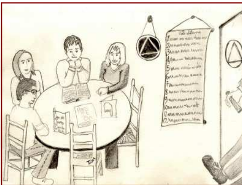
Titles in AA do not bring authority or honour

It is through the work of group members in AA that: alcoholics in the community learn that AA is available and how to find it; calls for help are answered; a meeting place is provided, made ready, and cleaned up after meetings; programmes are arranged for meetings; literature is on hand, and refreshments are served; the necessary money is collected and properly spent; group problems get solved; necessary contact is made with the rest of AA – locally through intergroup and nationally through General Service Offices in Spain, UK, USA or Central Europe.