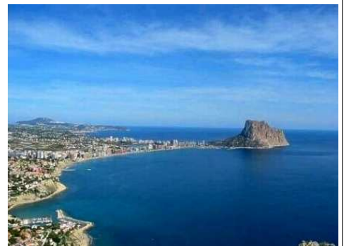
April 1987: 1st English-speaking AA meeting held in Calpe

You may wonder who you will see at a meeting of AA. The answer is twofold. Firstly, anyone or everyone, whose life has become unmanageable and has a desire to stop drinking. Secondly, I couldn't tell you exactly. We are anonymous; deliberately and carefully